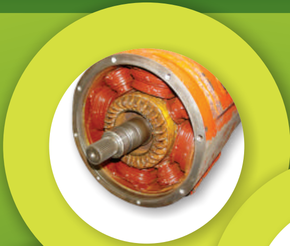
Mining machine DC motor 35 HP 250 Vdc