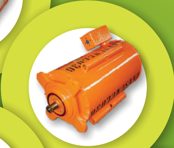
Mining machine AC motor 50/50 HP 950 Vac