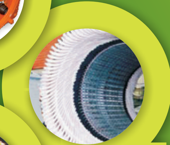
Stator wired with rectangular wire and pre-formed coils