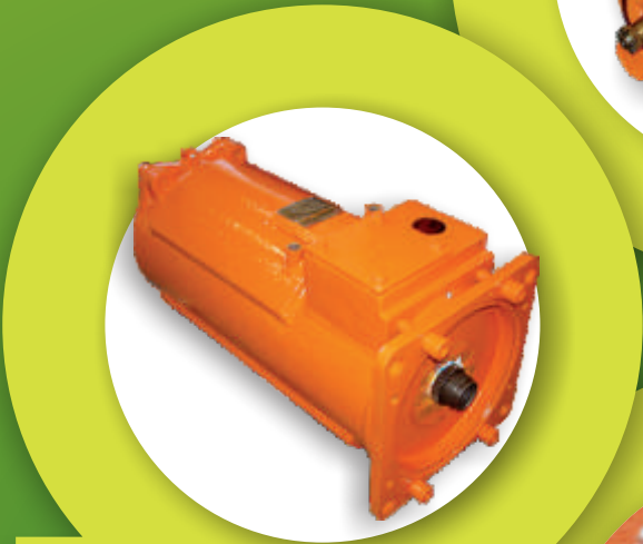
Mining machine AC motor 210 HP 950 Vac WATER Cooled