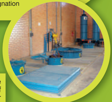
Manufacture and recovery of squirrel cage rotor