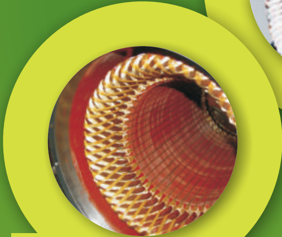
Stator wired with round wire and pre-formed coils